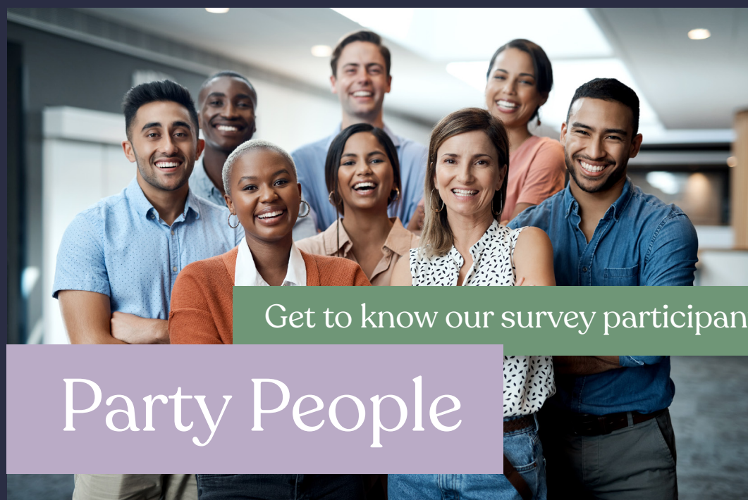
Get to know our survey participants